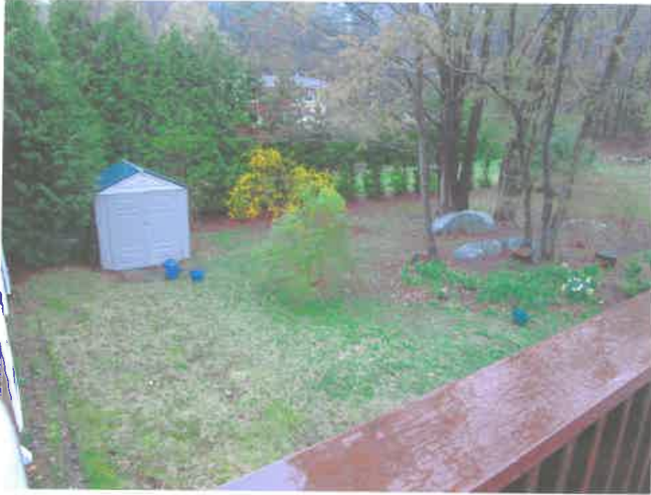
Our backyard to the left (above) and right (below)